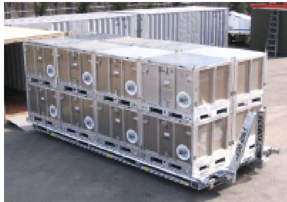
(16) J-MIPs be can locked on a J-MIP Under license from Lock Nest LLC.