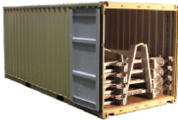
J-MIPs stacked 4-high and secured in an ISO container