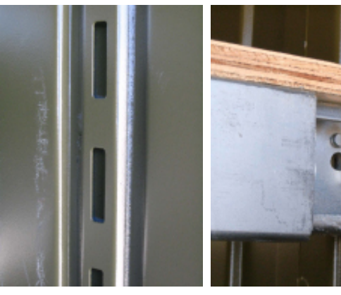
Shoring & Decking Beam engages on vertical "E" track system on ISO Container wall