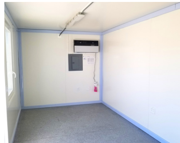
Pictured: Interior Office Space