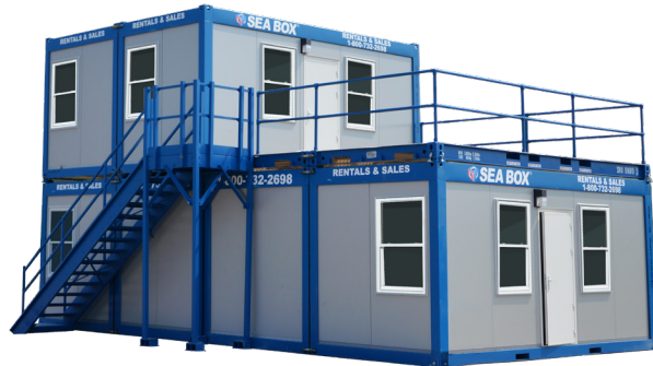
Pictured: 2 level custom MOBU complex, shown with 4 window, 1 door setup