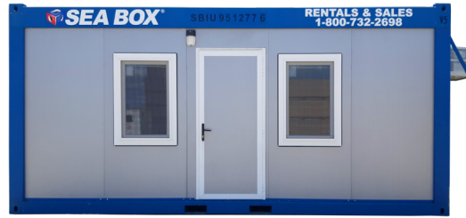
Pictured: SB3645.9 LBMO-2, standard 2 window, 1 door setup