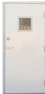
Pictured: Steel Door w/Window (optional)