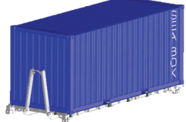
20' x 8'0" Wide ISO Container on top of the 20' PLS Flatrack